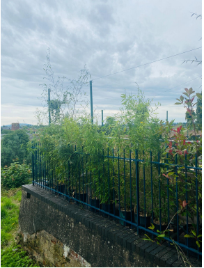
VIEW FROM THE RIVER